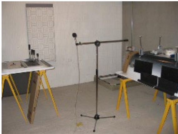
Fig. 3: Measuring set-up in the basement – vertically below measuring room 1.2