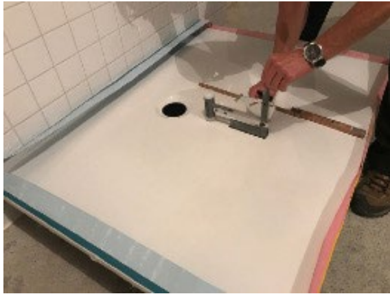
Fig. 1: Assembly condition in the stimulus room