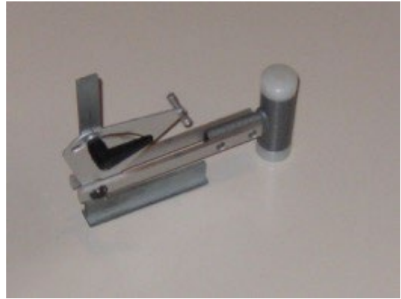
Fig. 2: EMPA pendulum drop hammer